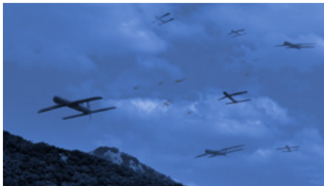
Suicide drone swarms present an asymmetric threat