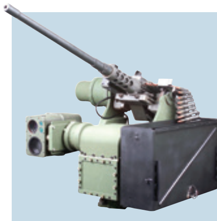
EOS CROWS II with a 0.50 cal heavy machine gun

Additional orders for the EOS CROWS I followed in 2005, and in late 2006 an AU$14 million contract to supply 44 RWS to the Australian Defence Force (ADF)