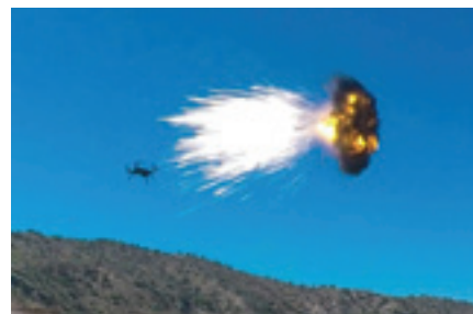
Kinetic CUAS using airburst munition

Developed and manufactured in-house by EOS, the DE system – which includes the beam director and the co-mounted optical