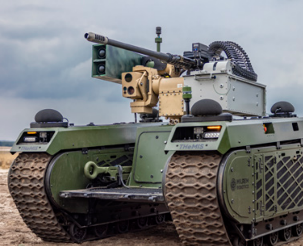
R400S on the Milrem THeMIS unmanned ground vehicle