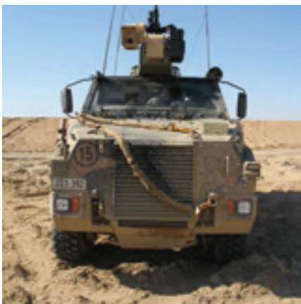
ADF Bushmaster in operation with EOS R400S

unit for fitment to a variety of direct and indirect fire weapon systems.