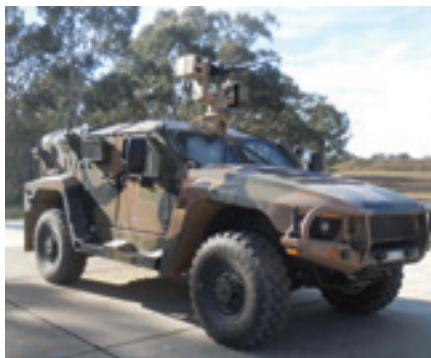
The R150S with 12.7 mm heavy machine gun on a Hawkei vehicle