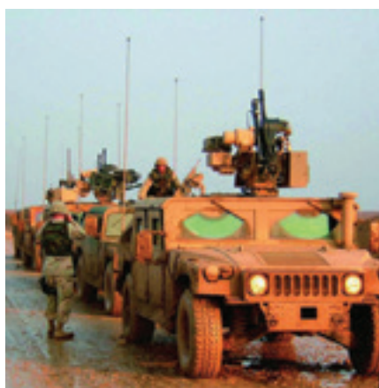
US Army "Hummers" with EOS CROWS I in Iraq