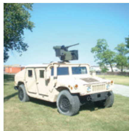
EOS CROWS I on a US Army "Hummers"

Having designed and engineered optical payloads ruggedised for the challenging conditions involved in launch into space, along