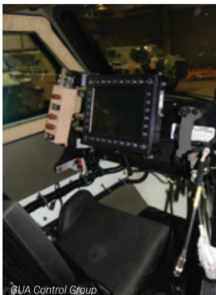
GUA Control Group