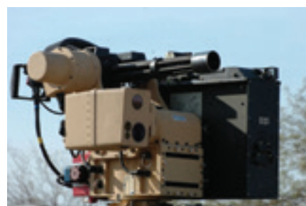
RWS fitted with Dillon Aero M134-Series minigun

target identification and tracking system – is designed to address Group I, II and III UAS swarm threats, with high rates of target engagement, out to ranges of 4000 m.