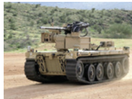
R400S on the Pratt & Miller Engineering expeditionary modular autonomous vehicle