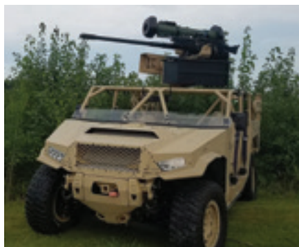
R400S Mk2-HD Dual with M230LF 30 mm cannon, 7.62 mm and Javelin missile on the Polaris Dagor vehicle