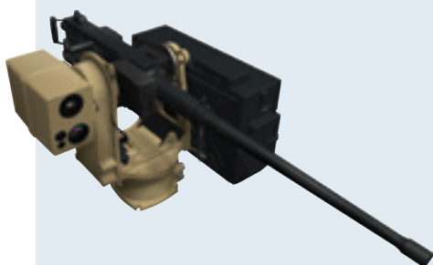
LIGHT GIMBAL: R150S with 12.7 mm heavy machine gun