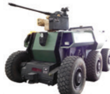
R400S with M230LF 30 mm cannon on the IAI LR2 unmanned ground vehicle