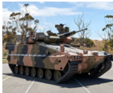
The T2000 with MK44S 30 mm cannon and the R400S Mk2 D-HD with 12.7 mm heavy machine gun on the Hanwha Defense Australia AS21 Redback vehicle

EOS has delivered more than 2,100 RWS to a range of customers, mounted on over 20 different platforms. The common control interface can be integrated with various architecture standards and customer-specified display units. Integration with vehicle battle management systems adds capabilities such as Slew-to-Cue and Far Target Location, and offers easy integration to other vehicle systems such as local situational awareness sensors, HUMS and active protection systems.