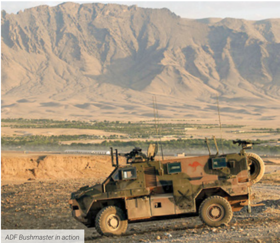
ADF Bushmaster in action

EOS is a completely vertically integrated Original Equipment Manufacturer for major system components, and thus maintains control over the obsolescence chain.