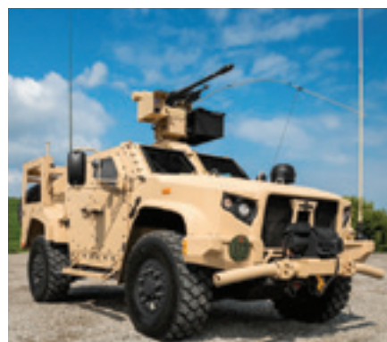
R400S Mk2 Dual with M230LF 30 mm cannon and 7.62 mm on the JLTV vehicle

Used with the cooled sensor unit, the RWS provides advanced surveillance and integrated battlefield sector scanning capabilities. It can be programmed with up to 200 target reference points for rapid engagement directly from surveillance mode. Firing inhibit zones can be programmed into the system, which also has a video tracker with recording options. First round hit probability is enhanced by a