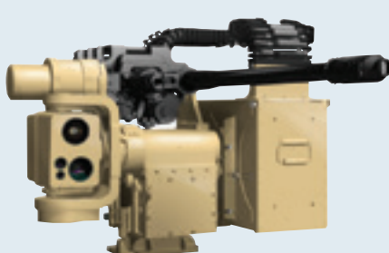
MEDIUM GIMBAL: R400S Mk2 with M230LF 30 mm cannon