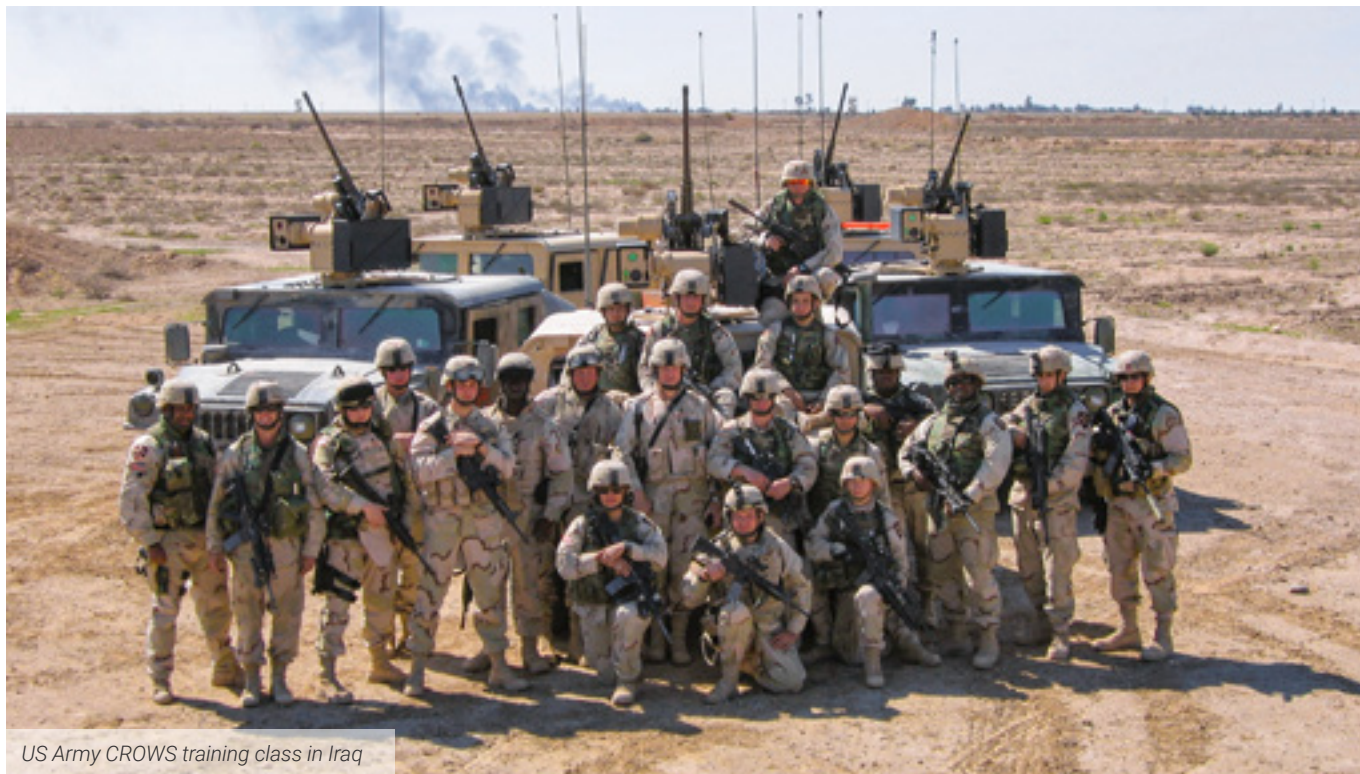
US Army CROWS training class in Iraq