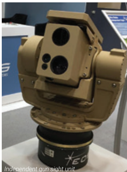
Independent gun sight unit