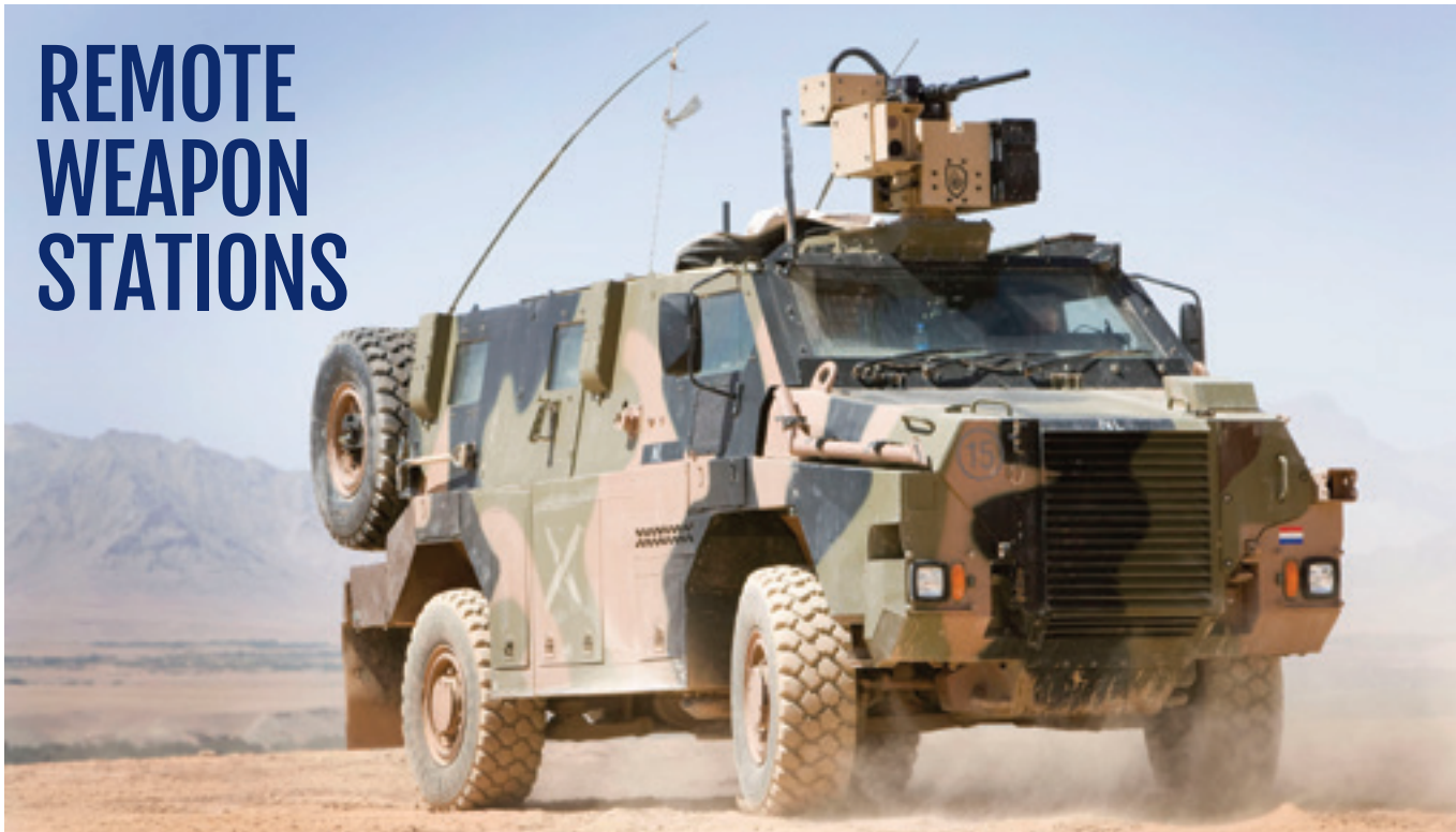
R400S Mk1 with 12.7 mm heavy machine gun on a Dutch Bushmaster vehicle

Only a company with decades of experience in producing ruggedised and precise systems for demanding space and defence customers has the ability to deliver precision engagement to the maximum specification of any mix of weapons. EOS has the knowledge to understand the harsh demands of firing from a moving vehicle, against moving targets, in harsh environments, day or night – while accounting for demanding platform vibration and motion variables.