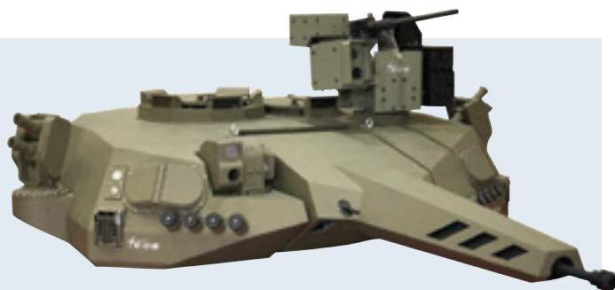
TURRET: The T2000 with MK44S 30 x 173 mm cannon and R400S Mk2 D-HD with 12.7 mm heavy machine gun