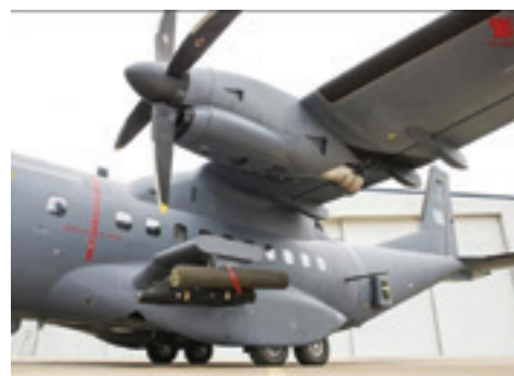
Although RWS are mainly applied to land platforms – including main battle tanks such as this M1A2 (top right), EOS' technology can also be employed at sea and in the air – as represented here by a riverine craft (left) and the 30 mm cannon installation in an AC-235 (above)