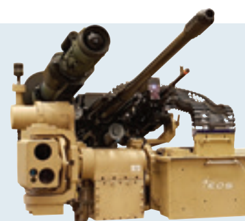
MEDIUM GIMBAL: R400S Mk2-HD Dual with M230LF 30 mm cannon, 7.62 mm and Javelin missile