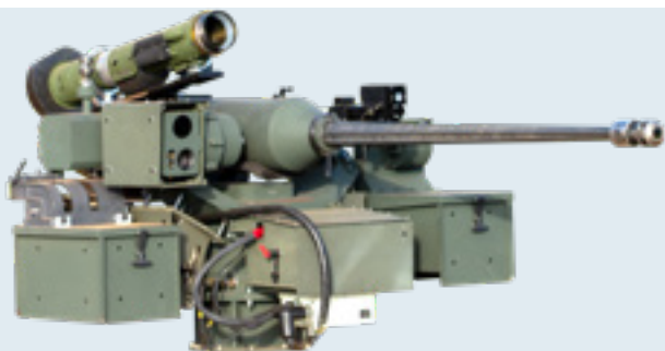
HEAVY GIMBAL: The R800S with MK44S 30 x 173 mm and Javelin missile

The R400S is considered a "plug-and-play" system that can be quickly integrated into battle management systems, while its design allows it to be packaged into small modules that can be dispersed around the interior of the vehicle to take up small spaces and minimise intrusion into the cabin.