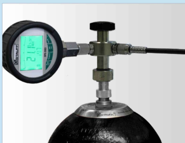
Bladder accumulator (DIGI Gauge)