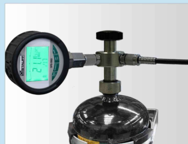
Diaphragm accumulator (DIGI Gauge)

Note: STAUFF pressure gauges are safety pattern type according to AS1349 with safety glass, solid baffle wall, and a stainless steel construction with excellent stability and shock resistance.