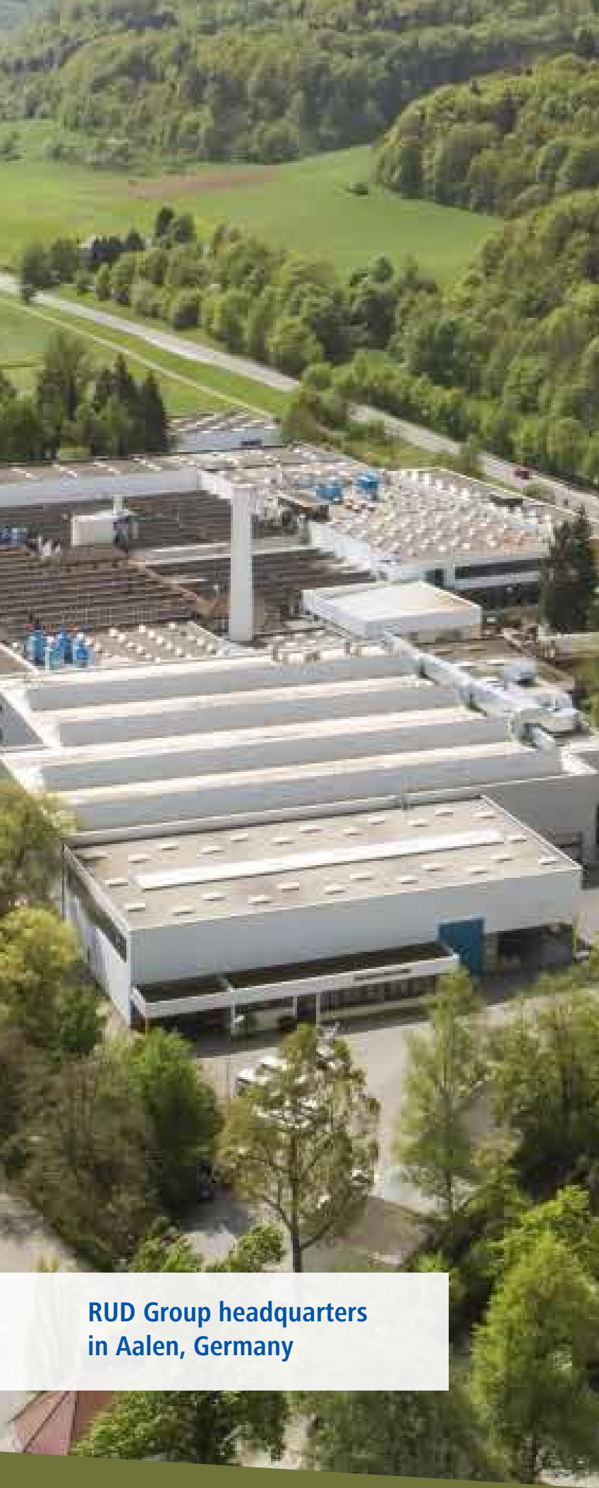
RUD Group headquarters in Aalen, Germany