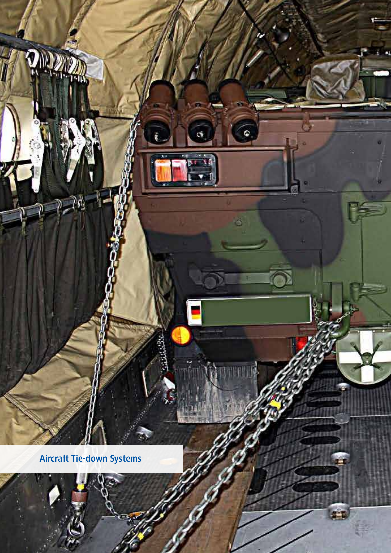
Aircraft Tie-down Systems