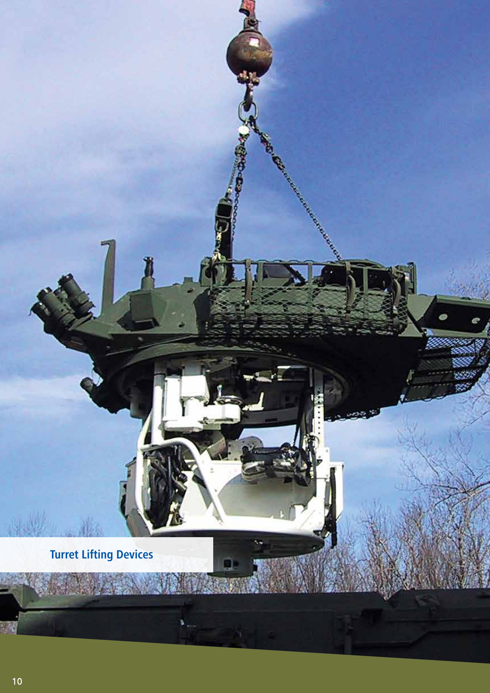
Turret Lifting Devices