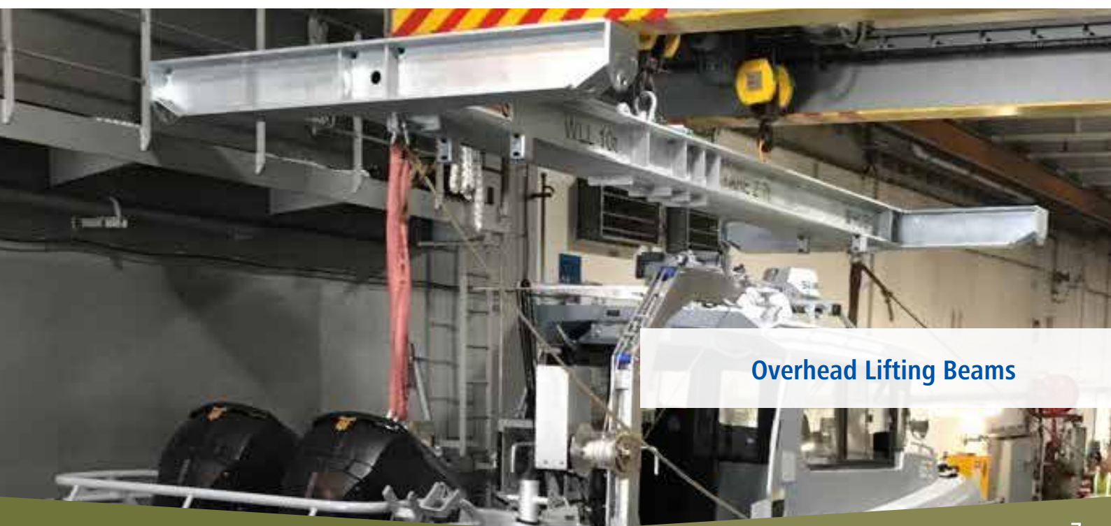
Overhead Lifting Beams