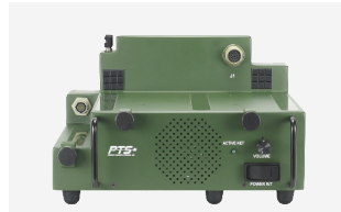
AS0003-SR-3A NSN 6130-01-581-7051 OD 1 RT-1523 (A-G) (ASIP)