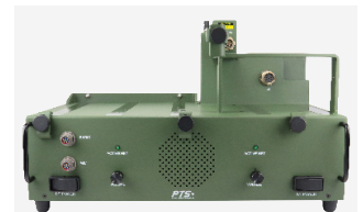
AS0150-HR-5833/1523 1 PRC-150 or 1 PRC-160 * requires RF-5833H PA 1 RT-1523 (E/F/G) (ASIP)