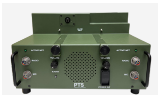
AS0162-CA-162 1 PRC-162