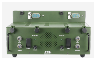
AS0117-HR-117G/152 1 or 2 PRC-117G * requires RF-7800M-V150 PA 1 or 2 PRC-152 * requires RF-300M PA