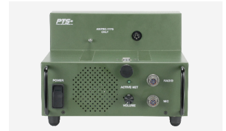
AS0117-HR-117G 1 PRC-117G