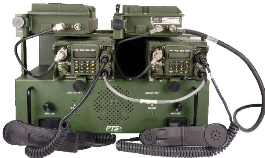
SR-4A with SINCGARS ASIPs, RT-1523s and handsets