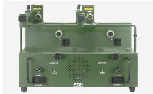
AS0004-SR-4 NSN 6130-01-618-9824 OD 2 RT-1523 (E/F/G) (ASIP)