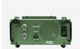
AS0150-HR-5833 1 PRC-150 or 1 PRC-160 * requires RF-5833H PA