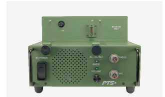
AS0160-HR-160 1 PRC-160