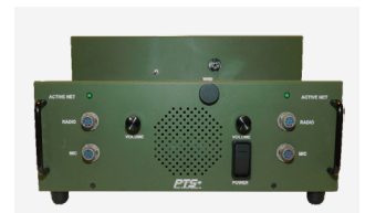
AS0167-HR-167 1 PRC-167