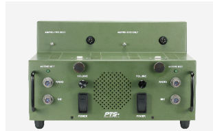
AS0117-HR-117G-D 2 PRC-117G