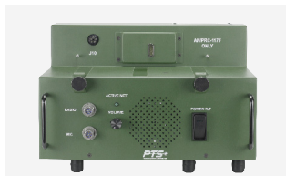
AS0117-HR-117F 1 PRC-117F