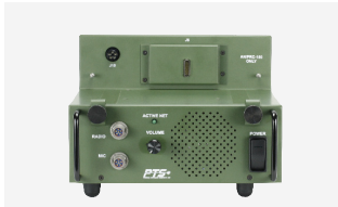
AS0150-HR-150 1 PRC-150