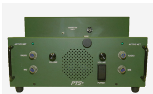
AS0158-HR-158 1 PRC-158