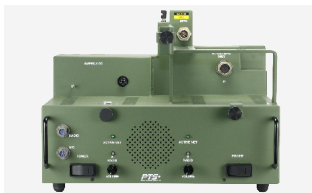
AS0117-HR-117G/1523 1 PRC-117G 1 RT-1523 (E/F/G) (ASIP)