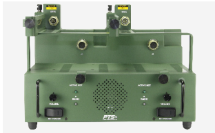
AS0004-SR-4A NSN 6130-01-578-4483 OD NSN 6130-01-577-7393 Tan 2 RT-1523 (E/F/G) (ASIP)