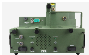
AS0117-HR-117G/1523HP 1 PRC-117G or 1 PRC-152 1 RT-1523 (E/F/G) (ASIP) * requires RF-7800M-V150 PA