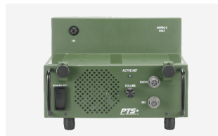
AS0005-RR-PSC-5 1 PSC-5